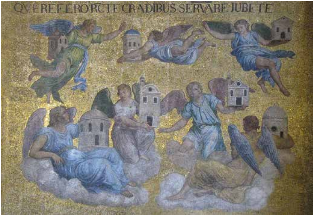
The angels standing guard to the seven churches of Asia. Mosaic in the Patriarchal Cathedral Basilica of Saint Mark, Venice, Italy.

Accordingly, the proponents of this theory admit that in view of the current state of evidence, it remains a “highly speculative” alternative to the construction of early Ottoman political and religious history in later Ottoman sources. 12 The other major problem is that the evidence of the Sheikh Bedreddin rebellion in the Balkans is insufficient to allow a conclusive reconstruction of Christian participation in its organization and abortive course. Hence the direct and circumstantial evidence of Christian involvement in and support for the Börklüce Mustafa insurrection in the Anatolian Aegean coastal area acquires even more importance, though the local Anatolian characteristics (despite some parallels) differed in a number of important respects from the north-eastern and eastern Balkans traversed by Sheikh Bedreddin in preparation for the armed rebellion.