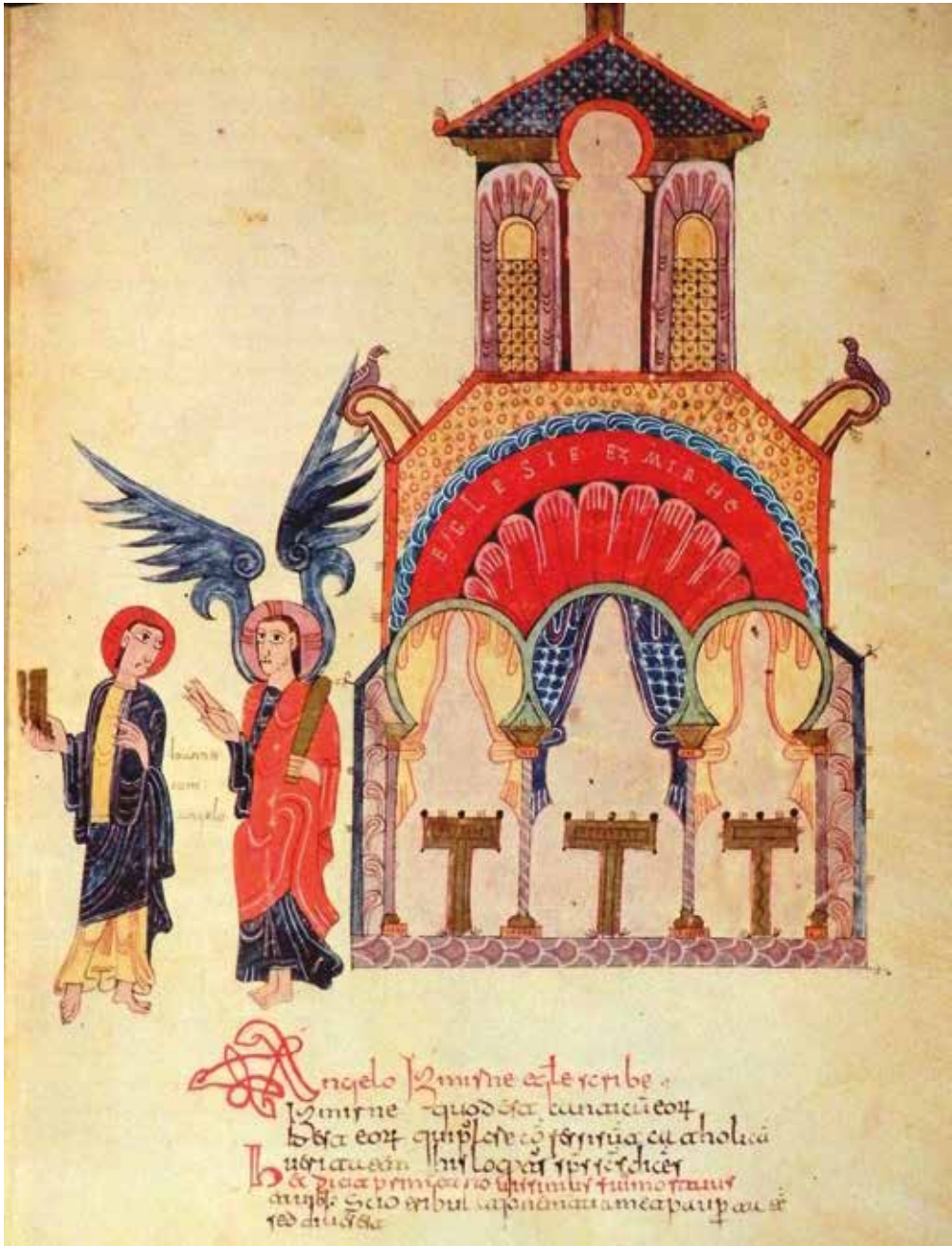
Church of Smyrna from Gerona Beatus , the Museum of the Cathedral of Girona, Catalonia, Spain. Public domain.